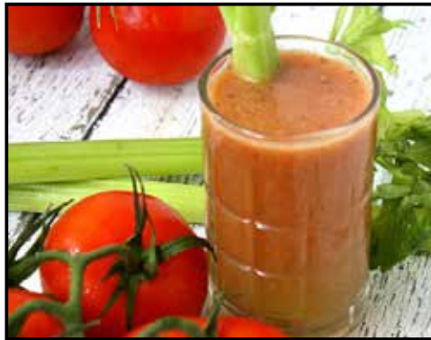
Haworth Wholefoods and Worth Valley Mag bring you fresh juice recipes to celebrate the launch of Haworth Wholefoods fruit & veggie boxes.

This juice is basically a Bloody Mary for the 21st century. You can take it whatever way suits your temperament or mood. Keep it clean and cosmic or go full on galactic with vodka & spice. Either way, it will put a zing in your Christmas step and a smile on your face. It may be winter but use the best tomatoes available, and make sure they are ripe! Add horseradish for additional pucker power. The garlic and jalapeno are antimicrobial, in other words, they will blast out whatever bacteria or fungi ails you! (Just tell friends it is a medicinal thing) Have yourself a very Merry Naughty but Nice Juice. Cheers!